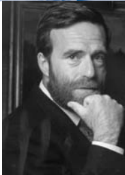
Guillermo de la Dehesa