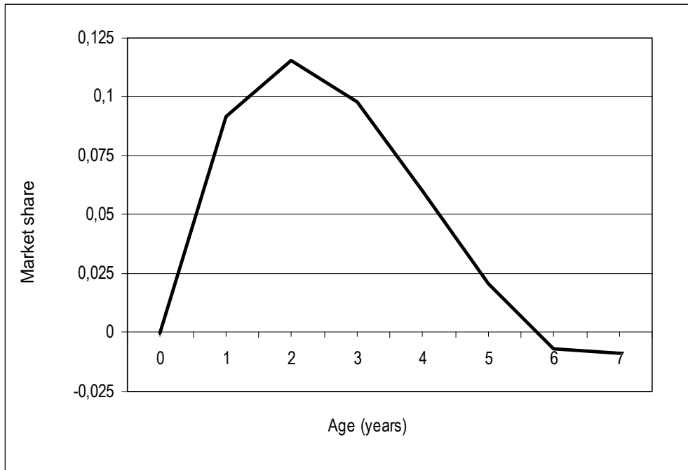
Figure 1: Estimated model age effect on market share, Table 1.